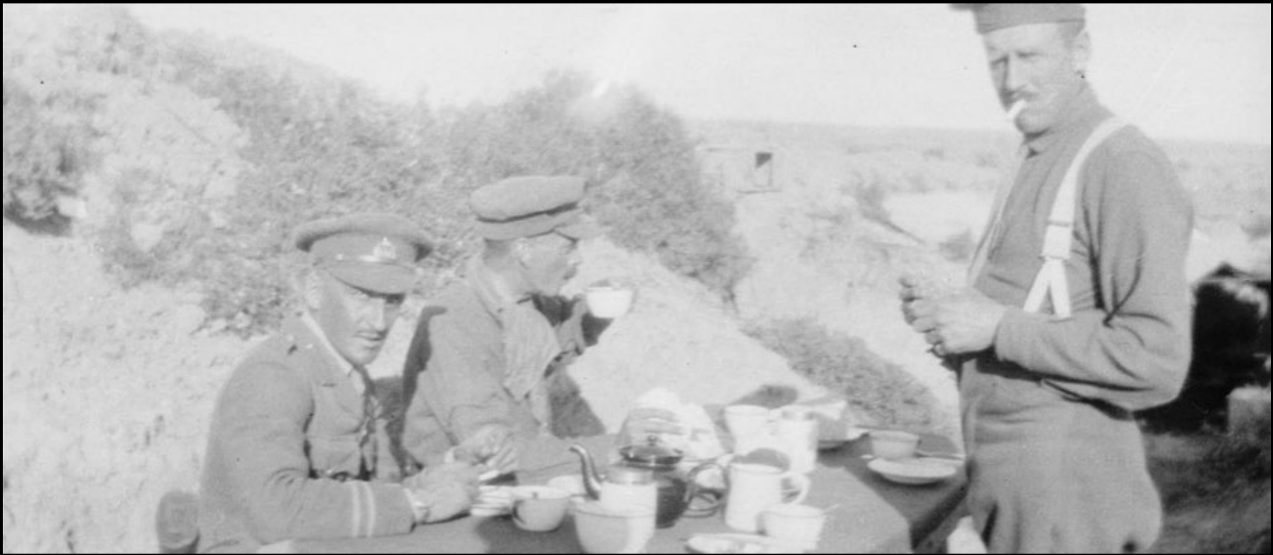
British officers enjoying a cuppa