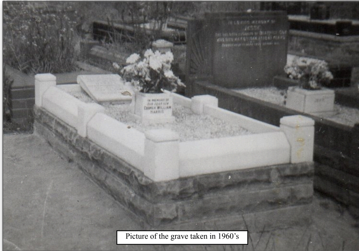
Picture of the grave taken in 1960's